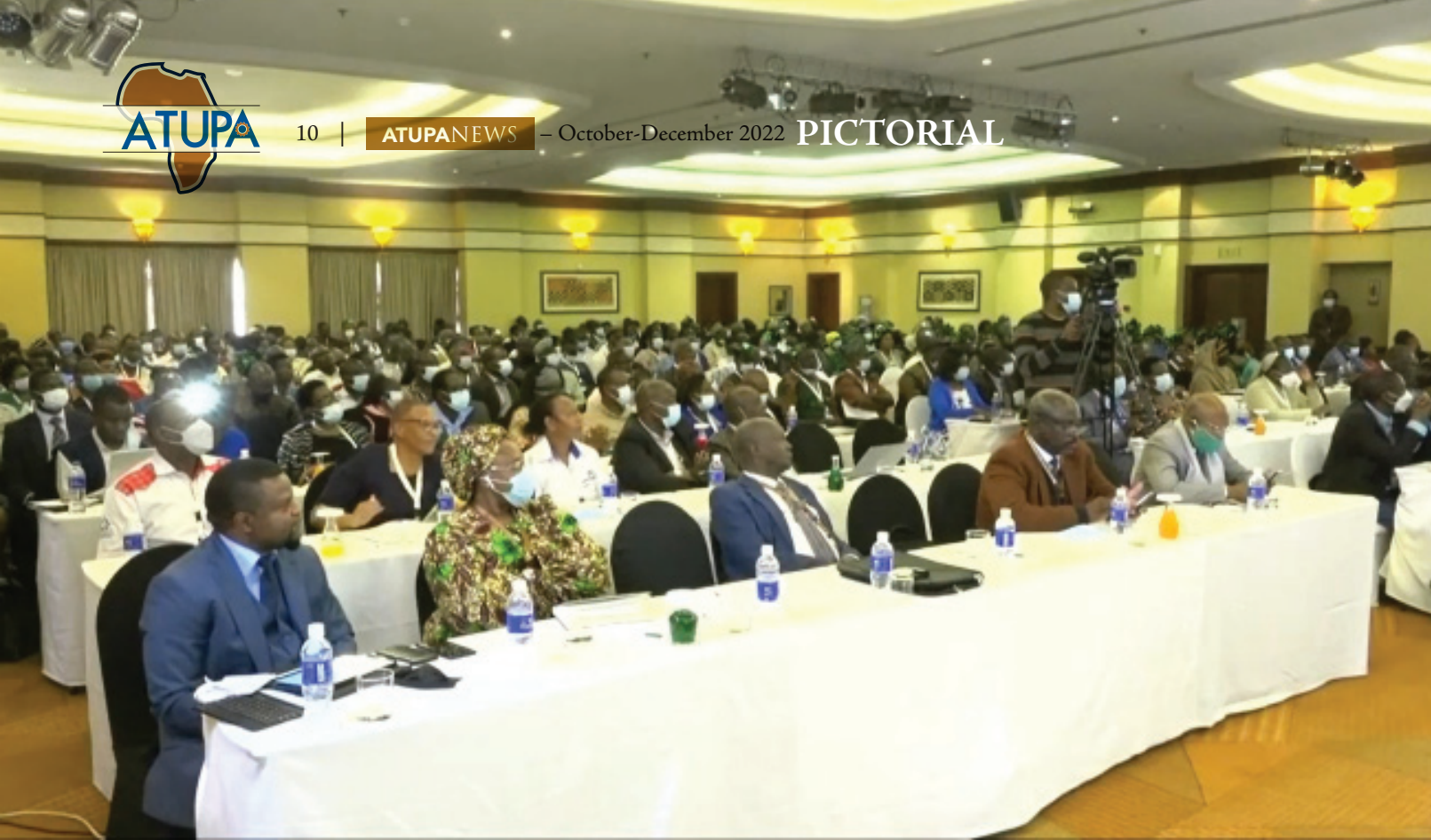
Participants follow proceedings at the ATUPA International Conference in Victoria Falls, Zimbabwe