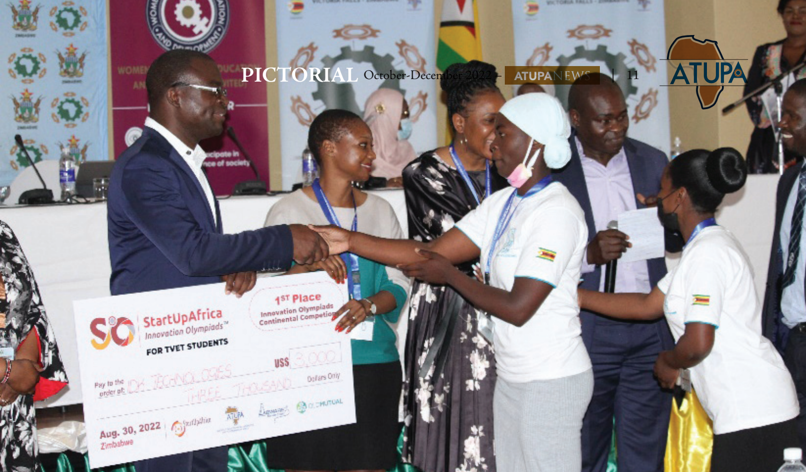
Minister for Higher and Tertiary Education, Innovation, Science and Technology Development, Republic of Zimbabwe, Professor Amon Murwira, presenting a dummy cheque of USD 3,000 to DK Technologies, the winners of the StartUpAfrica innovation challenge at the Fourth Pan-Africa Youth Conference in Victoria