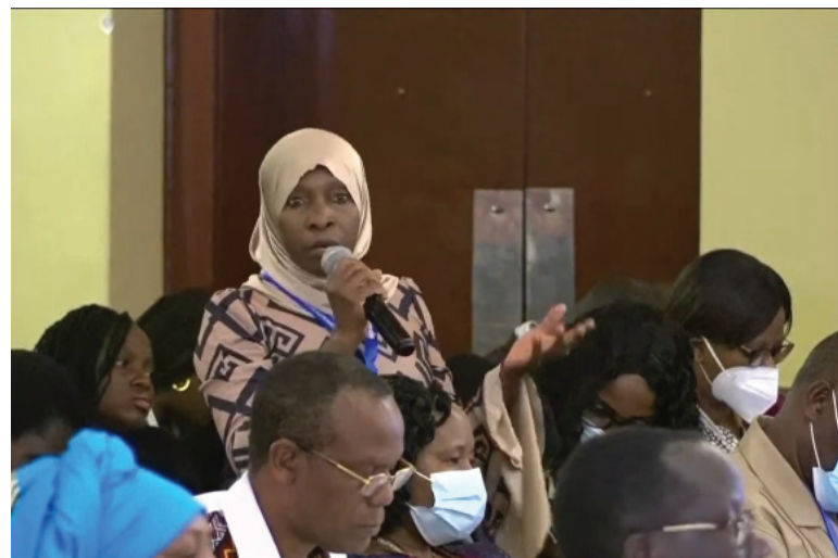
A delegate participating in the conversations on technical education and skills transfer