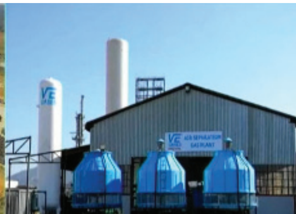
ate against the global pandemic: A solar power plant and an oxygen plant,