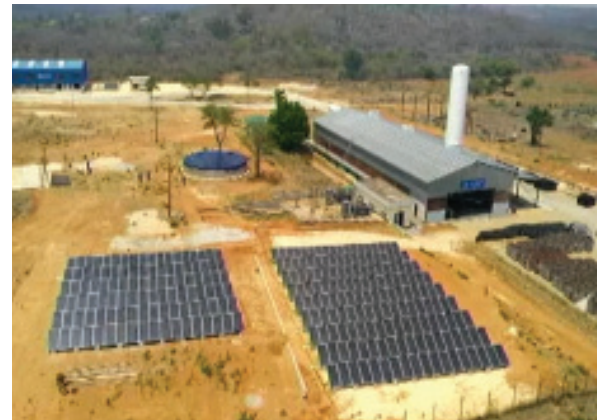
Some of the mega projects initiated by the Government of Zimbabwe to mitigate climate change, all run by TVET students and graduates