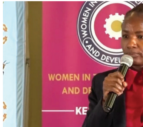
A WITED Kenya Chapter making a presentation