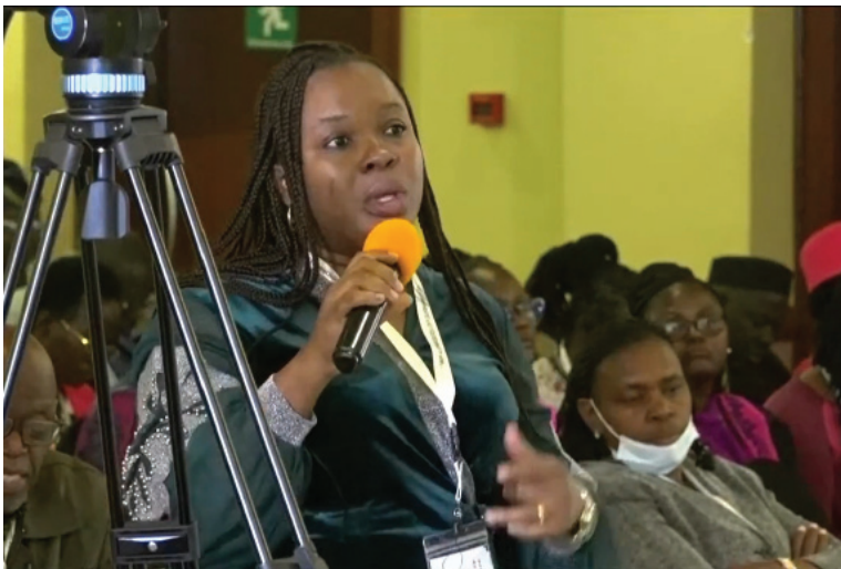
A participant weighing in on a presentation during a discourse on gender mainstreaming